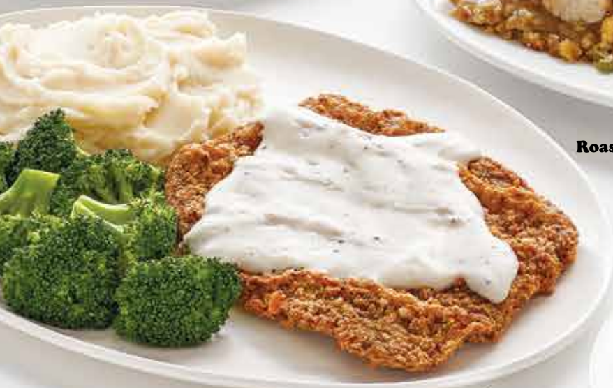
Country Fried Steak