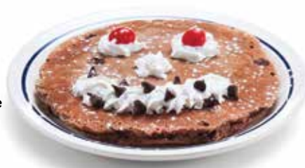
Funny Face® Pancake

Nutella® is a registered trademark of Ferrero S.p.A. All rights reserved. KRAFT is a registered trademark of Kraft Foods. MOTT'S is a registered trademark of Mott's LLP.