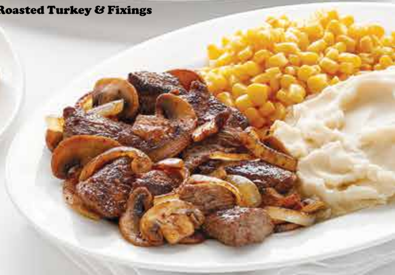
Sirloin Steak Tips