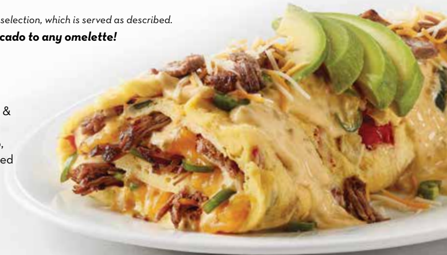
Spicy Poblano Omelette

Ham, hash browns, onions & Cheddar. Topped with sour cream.