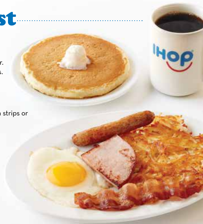
55+ Breakfast Sampler

Four triangles served with 2 bacon strips or 2 pork sausage links.