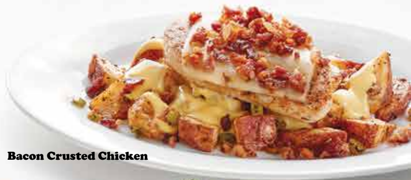
Bacon Crusted Chicken