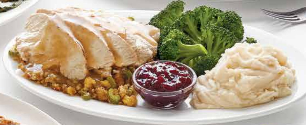
Roasted Turkey & Fixings